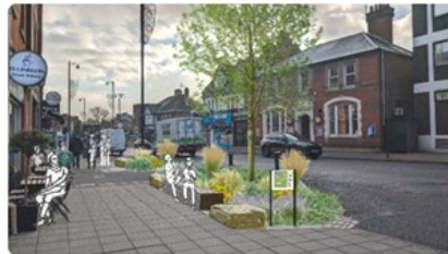
Site 02 - Streetview