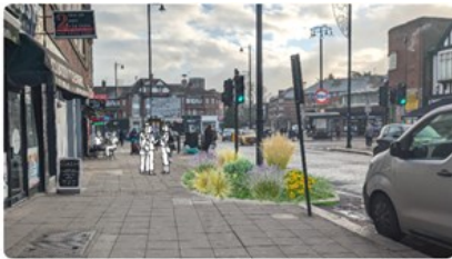
Site 01 - Streetview

A second project is the creation of three rain gardens on Chase Side. Participants in the event were invited to give their views to Enfield Council on ways in which the local environment might be further improved.