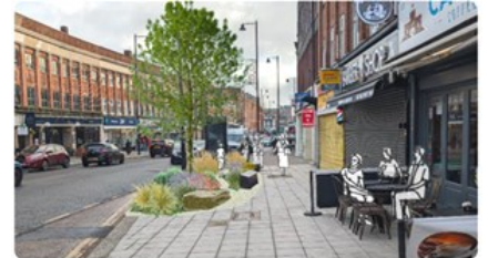
Site 03 - Streetview