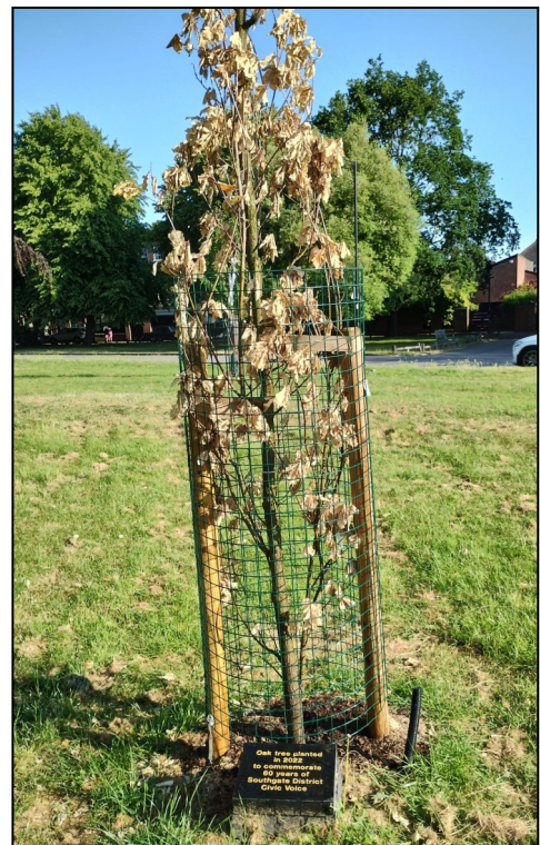
The tree wilting in June 2023

The council had committed to watering it once or twice a week, but by the end of May the hot dry weather had affected the tree badly and it was looking shriveled. Regular watering was done by members and others to try to revive it, but it's showing no signs of life again yet. We have been advised to continue watering it through the summer and if there is still no improvement we will ask the council to replace it, which is what they promised if it failed.