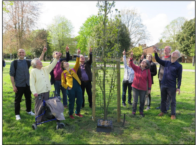
Celebrating the tree after our AGM in April

Our 60th Anniversary oak tree should have been planted last autumn, to co-inside with our celebration in October 2022, but there was a delay and Enfield Council couldn't plant it until the end of March 2023. The plaque had already been engraved, so the date was incorrect. However, the tree was an impressive specimen, about 15 feet tall and protected by a mesh fence around it. At our AGM in April some of us walked across to our new tree to celebrate its arrival.