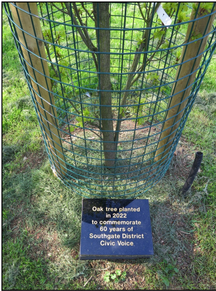
The plaque in position