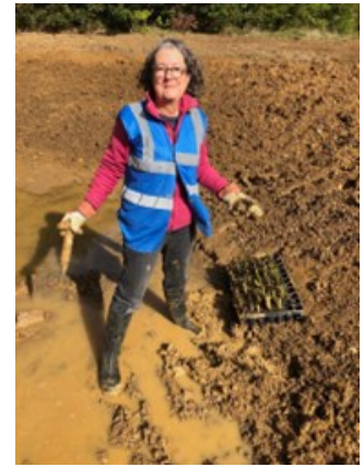
Taking a well earned rest!

Look out for more sessions on the Thames21 website: www.thames21.org.uk .