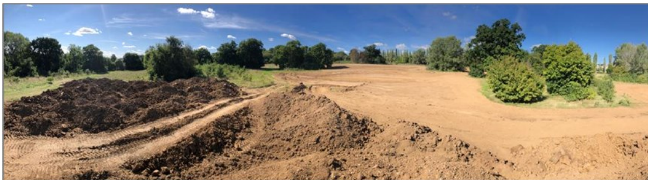
Photo: after the earth moving

Admittedly it was looking a bit bleak and bare at one point, but groups of volunteers have started to bring it to life.