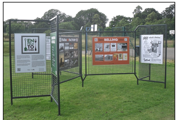
The exhibition in Grovelands Park

www.dugdalecentre.co.uk/page/2021-museum-exhibition for information about linked art workshop activities on 27th and 28th July and a jam-packed day of events at Forty Hall on Sunday 8th August.